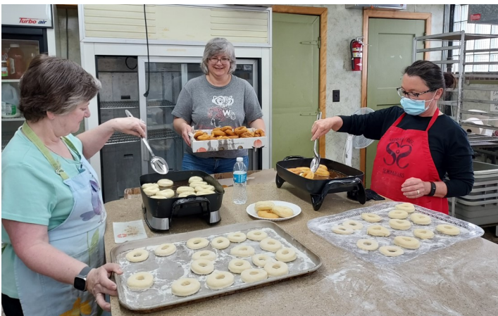
Donut Sale - May 8, 2021

Thank you for supporting the PCCW—Profit $741.00