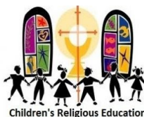
Children's Religious Education

Our faith matters. The more we help our children see the beauty of Catholicism, the greater are their chances of remaining faithful.