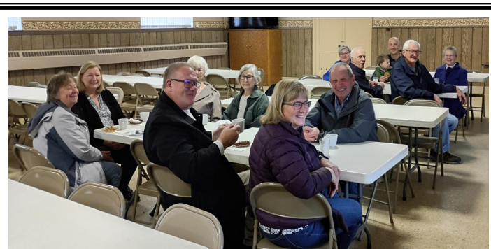
4/12/26 PCCW Coffee & Conversation welcomed 15 Parish members. Thank you!

~Franciscan Spirituality Center Free Program Offerings— The FSC offers a variety of free events and programs. Check out the offerings; support groups for those with overwhelming grief, depression, opportunities for creativity, wellness, growing hope and improving mental health.